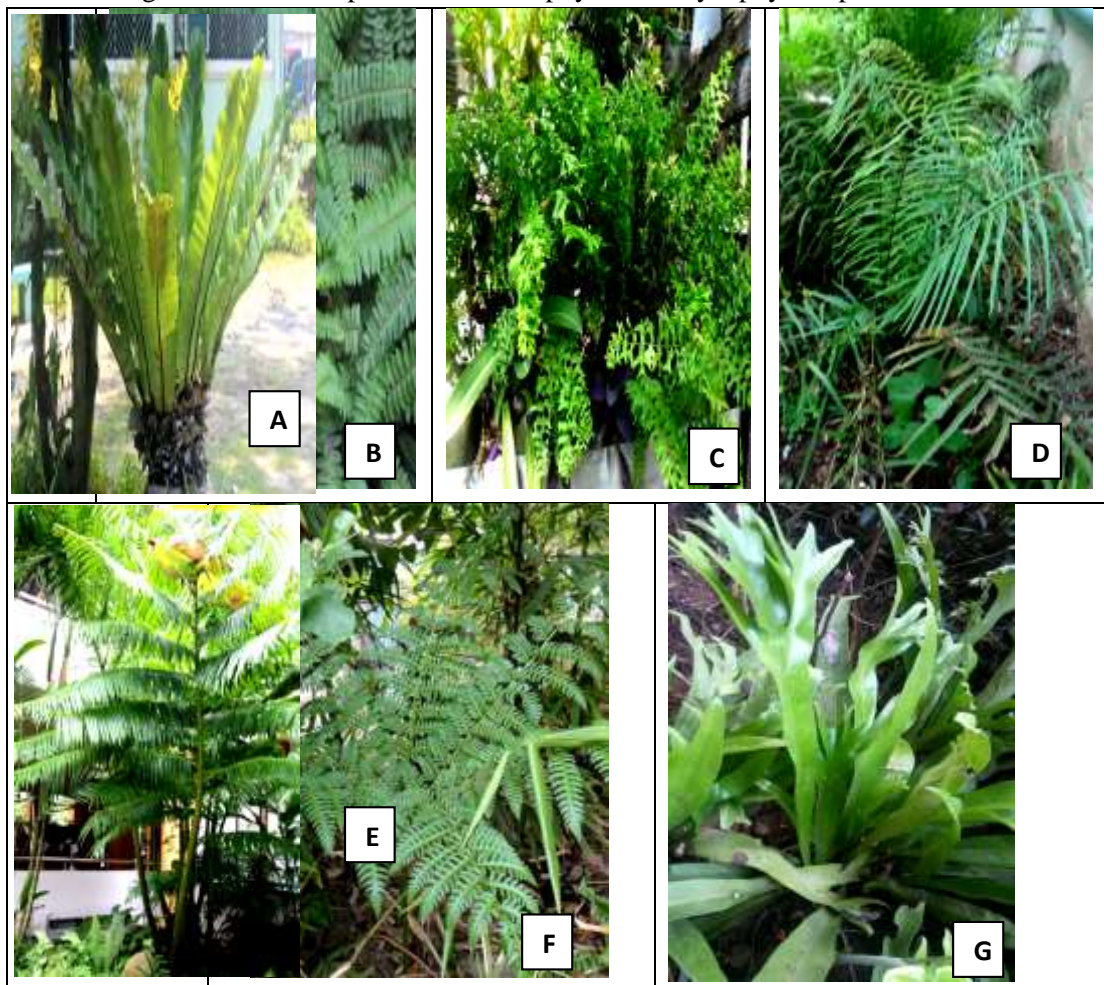
Fig. 3 Vulnerable Species of Pteridophytes and Lycophytes Species in UM

Legend : A - Asplenium nidus L.; B Nephrolepis exaltata (L) Schott; C. Nephrolepis biserrata (Sw.) Schott var furcans . D. Pteris vittata L.; E . Angiopteris evecta (G. Forst.) Hoffin; F. Pityrogramma calomelanos (L.) LinkG. Polypodium punctatum (L.) SW